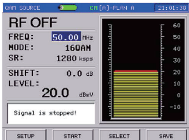
QAM Source Generator