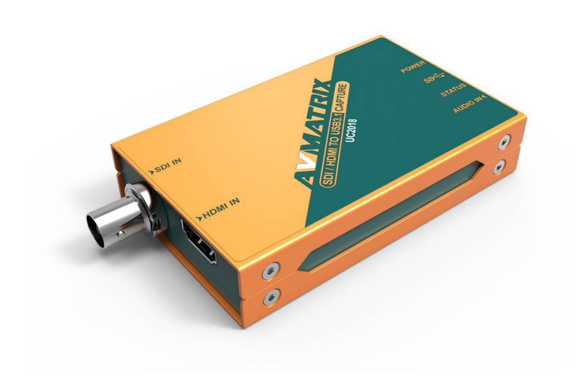
SDI & HDMI to USB3.1 Gen 1 Video Capture User Manual V1.0